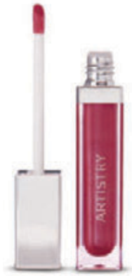
ARTISTRY Light Up Lip Gloss grabs attention wherever it shines.